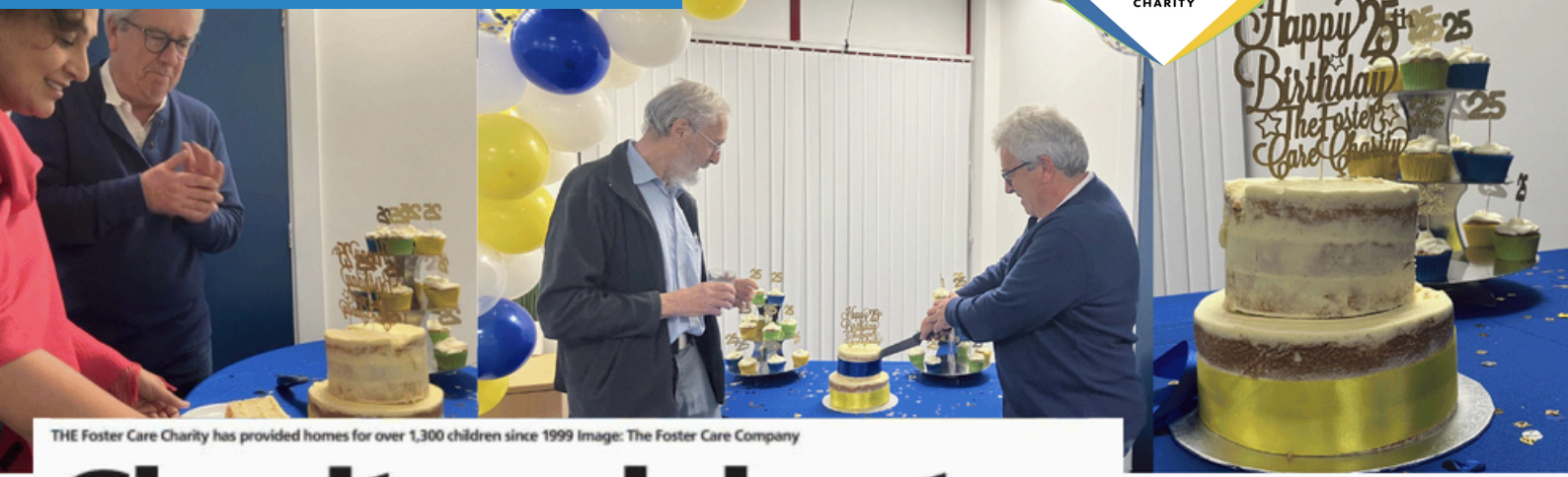
THE Foster Care Charity has provided homes for over 1,300 children since 1999