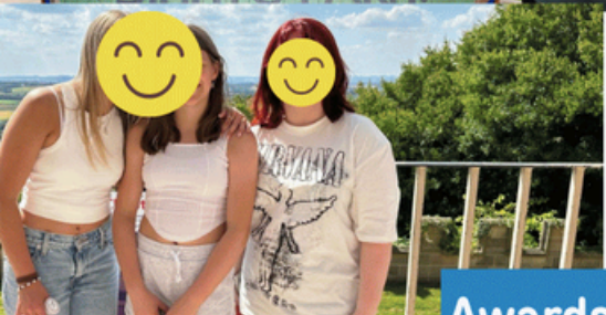
Awards & Surprises!