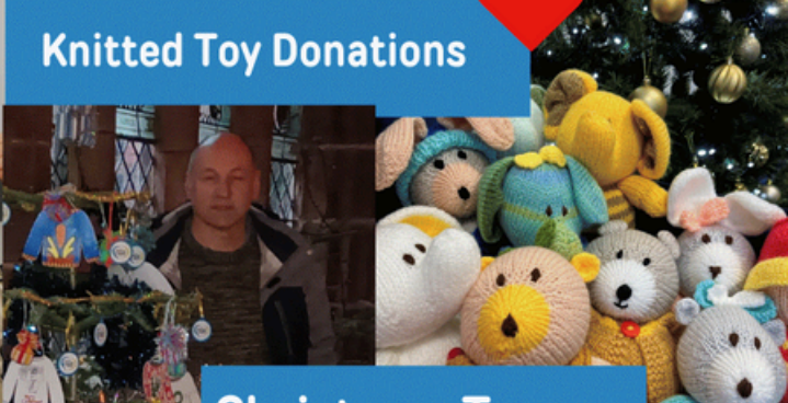
Christmas Tree Festivals