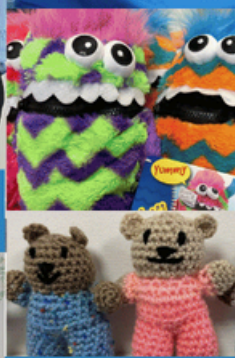
Knitted Toy Donations