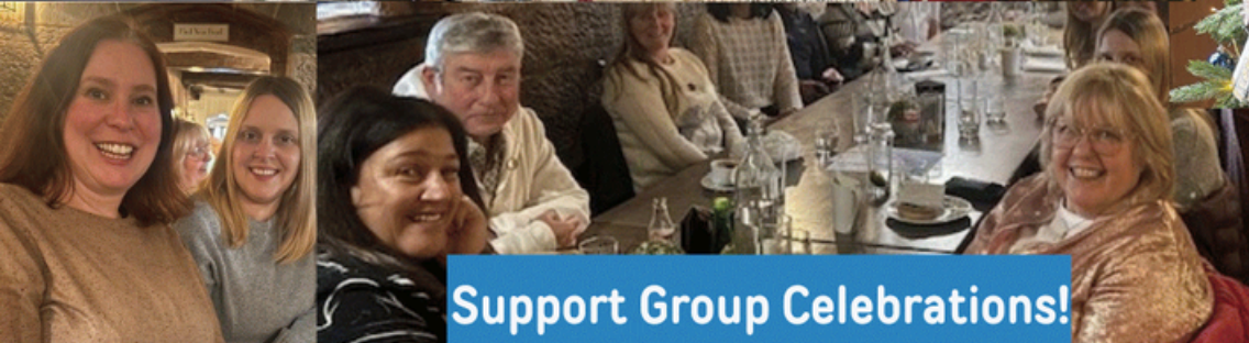
Support Group Celebrations!